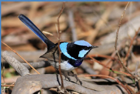
SUPERB FAIRY WREN